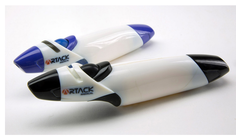
This articulated hernia mesh fixation device prototype was 3D printed complete with logo.