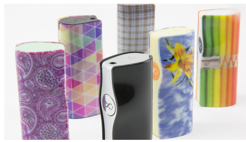
This mobile phone charger sleeve was prototyped with many image options.

Before the Stratasys J750, Prototyping Manager Omer Gassner would have tapped several vendors to create a single keypad panel prototype — using CNC machining and water printing for the body, casting for the light pipes, sanding for smoothness and then silicone engraving and additional printing for the buttons. This process would have taken anywhere from ten days to two weeks to create, at a cost of $700 per unit. With the Stratasys J750, it took just hours and cost $200 per unit.