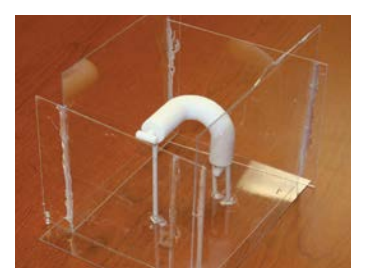
Figure 5: The pattern is mounted on dowels and attached to the floor of the mold box.