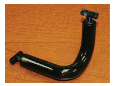
Figure 4: A soluble core for the radiator hose