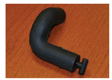
Figure 10: Finished hose part with soluble core in.