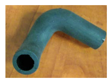
Figure 11: Final hose-part