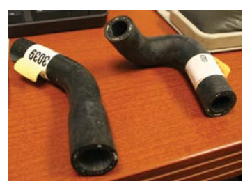
Figure 1: These hoses are examples of parts that need soluble cores since the RTV tool cannot be extracted from the internal passage.