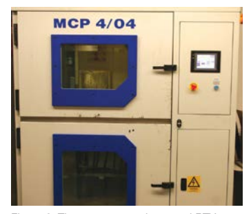
Figure 8: The two-part urethane and RTV mold are placed in the automated vacuum casting machine.