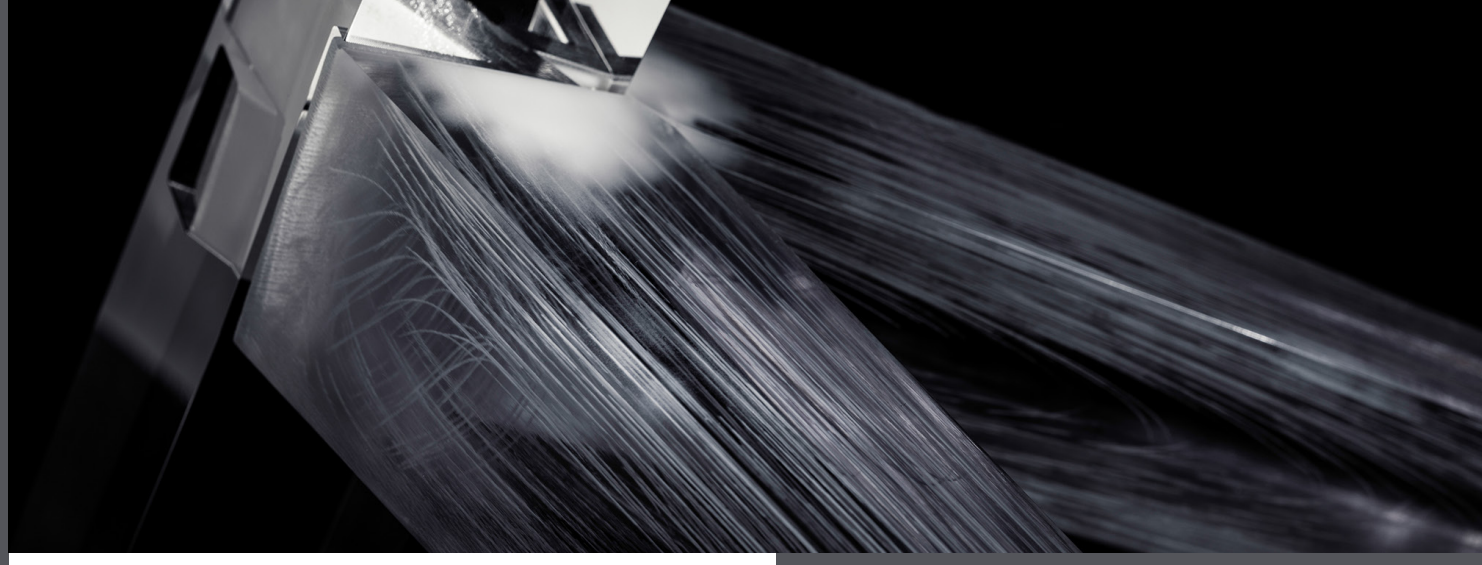
DManD researchers 3D printed the interlocking table in VeroClear, Vero PureWhite and TangoPlus.