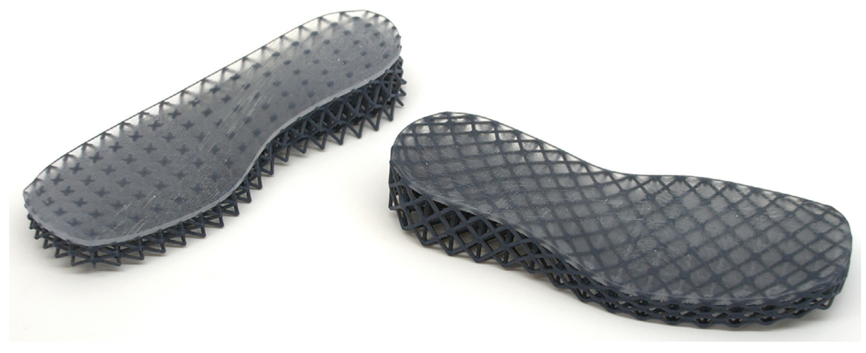
DManD researchers created multi-material soft-lattice structures for this footwear prototype using a custom design, analysis and slicer tools to spatially control stiffness and non-linear