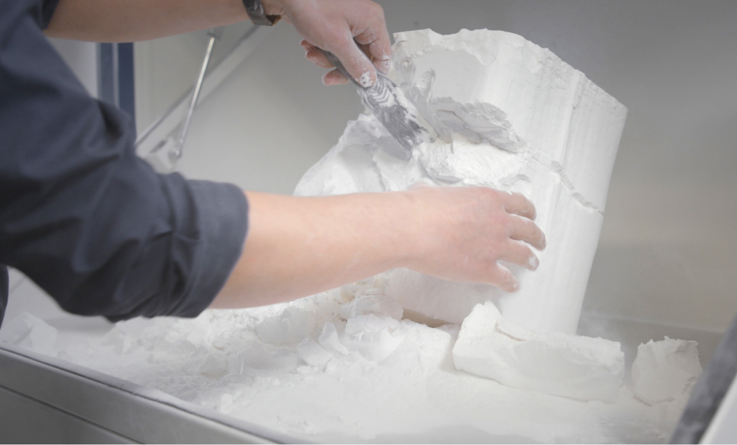
The H350 uses an infrared sensitive HAF™ to fuse particles of polymer powder together in layers to build parts

However, when it comes to producing volumes of up to several thousand parts, Goetz has been reliant upon traditional manufacturing methods like injection molding. While part quality is great, this has come at a cost to the business with mold production extremely costly and time-intensive.