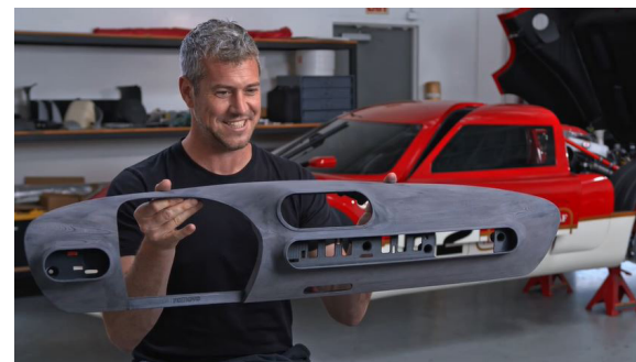
The 3D printed dashboard instrument panel will be covered with leather before installation.