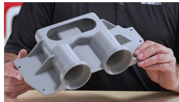
ASA heating/cooling duct production part ready for under-dash installation.