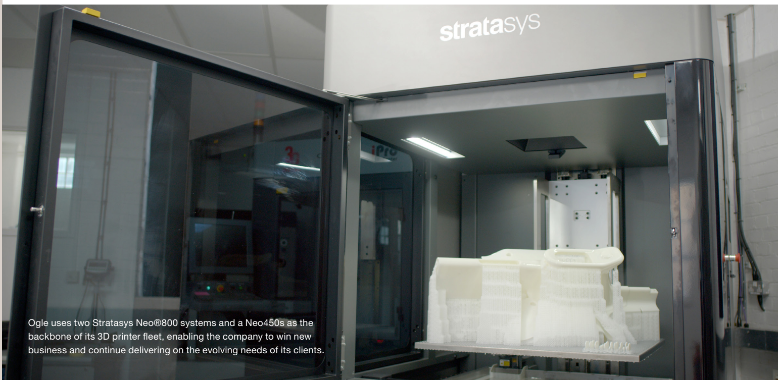
Ogle uses two Stratasys Neo@800 systems and a Neo450s as the backbone of its 3D printer fleet, enabling the company to win new business and continue delivering on the evolving needs of its clients.

As part of its constant forward gaze, Ogle was among the first model makers in the UK to recognize that 3D printing was going to revolutionize the way models and prototypes are created. With the emergence and rapid development of computer aided design (CAD) software, designs moved from drawing boards to motherboards and a fully digital design process started to make sense. In 1996, Ogle invested in its first stereolithography (SL) machine and has been 3D printing ever since.