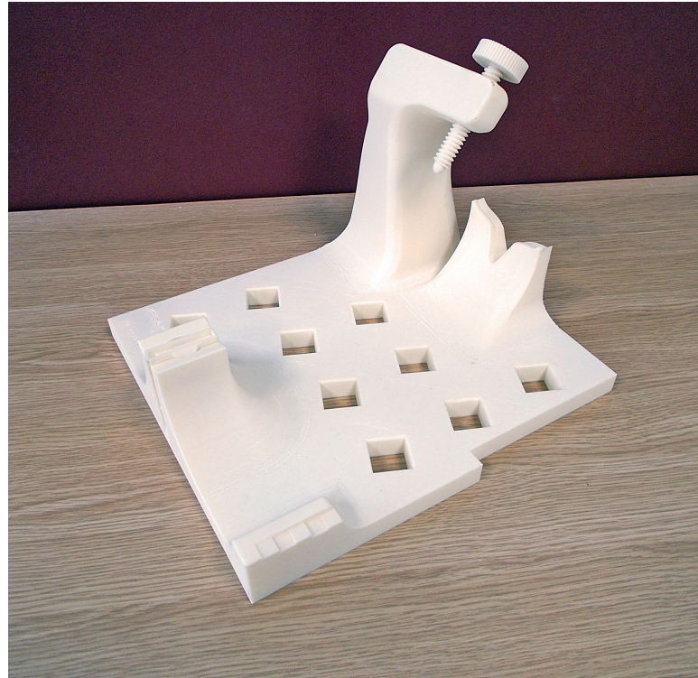
Moog produces a dedicated CMM fixture for every machined component produced on-site at Wolverhampton.

Moog reviewed many options during the evaluation phase and chose the Stratasys Fortus 380mc™ 3D Printer because it met all the required technical standards. "The FDM process of the Fortus 380mc produced a more stable part through the sampling process," said Stuart-Young. "Furthermore, the build envelope and printing materials satisfied our needs, and the price was within our budget."