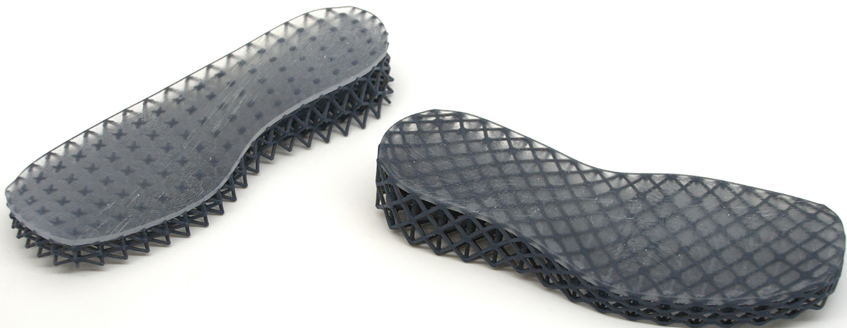
DManD researchers created multi-material soft-lattice structures for this footwear prototype using a custom design, analysis and slicer tools to spatially control stiffness and non-linear