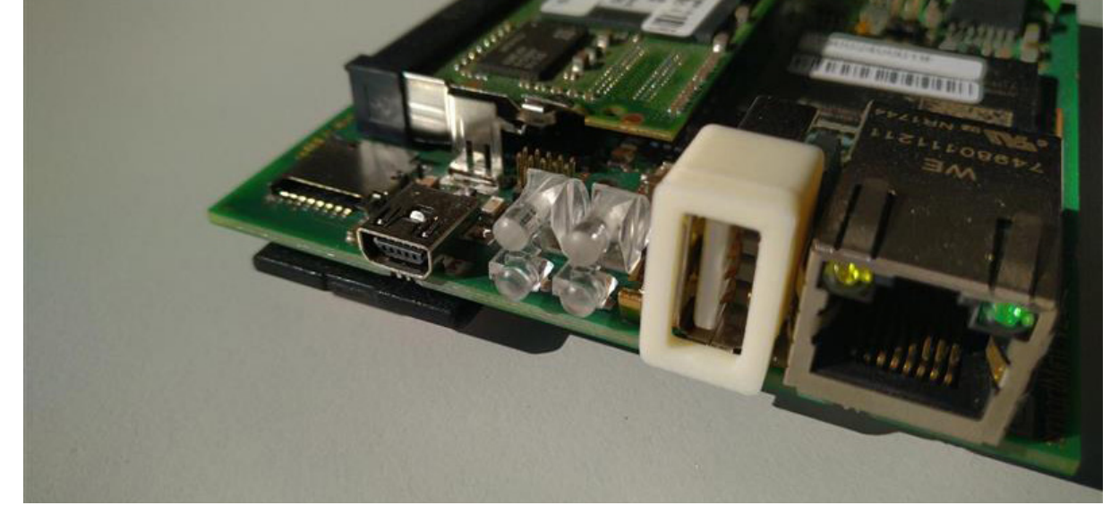
3D printed prototype of a USB port