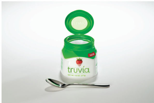
The Truvia package was designed to be attractive enough that consumers would want to display it on their countertop.