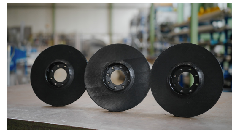
For the impeller, 3D printing has significantly reduced lead times by up to 50% compared to traditional metal machining.

For the impeller, 3D printing has significantly reduced lead times," says Kister. "Compared to traditional metal machining, 3D printing the part has equated to lead time savings of up to 50%. For other parts we manufacture, such as the inlet nozzle, which measures the flow rate in the fan, we can reduce the manufacturing lead times from 1.5 weeks down to three days with 3D printing."