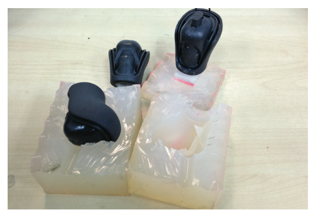
Solidify 3D printed a master part to create these silicon rubber molds for their automotive client.