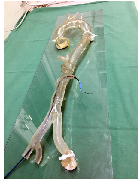
Transparent 3D printed model of a patient-specific aortic arch used by the University Hospital Mainz to practice complex endovascular surgeries.

“Based on current studies, we are seeing savings in operating time of 5-45 minutes when using 3D printed models prior to surgery,” said Dr. Dorweiler. “Research is still ongoing, but if you take an average surgery time of two to four hours, you are looking at time savings of up to 40%. When you are dealing with complex vascular cases every day, these time-savings can be the difference between life and death.”